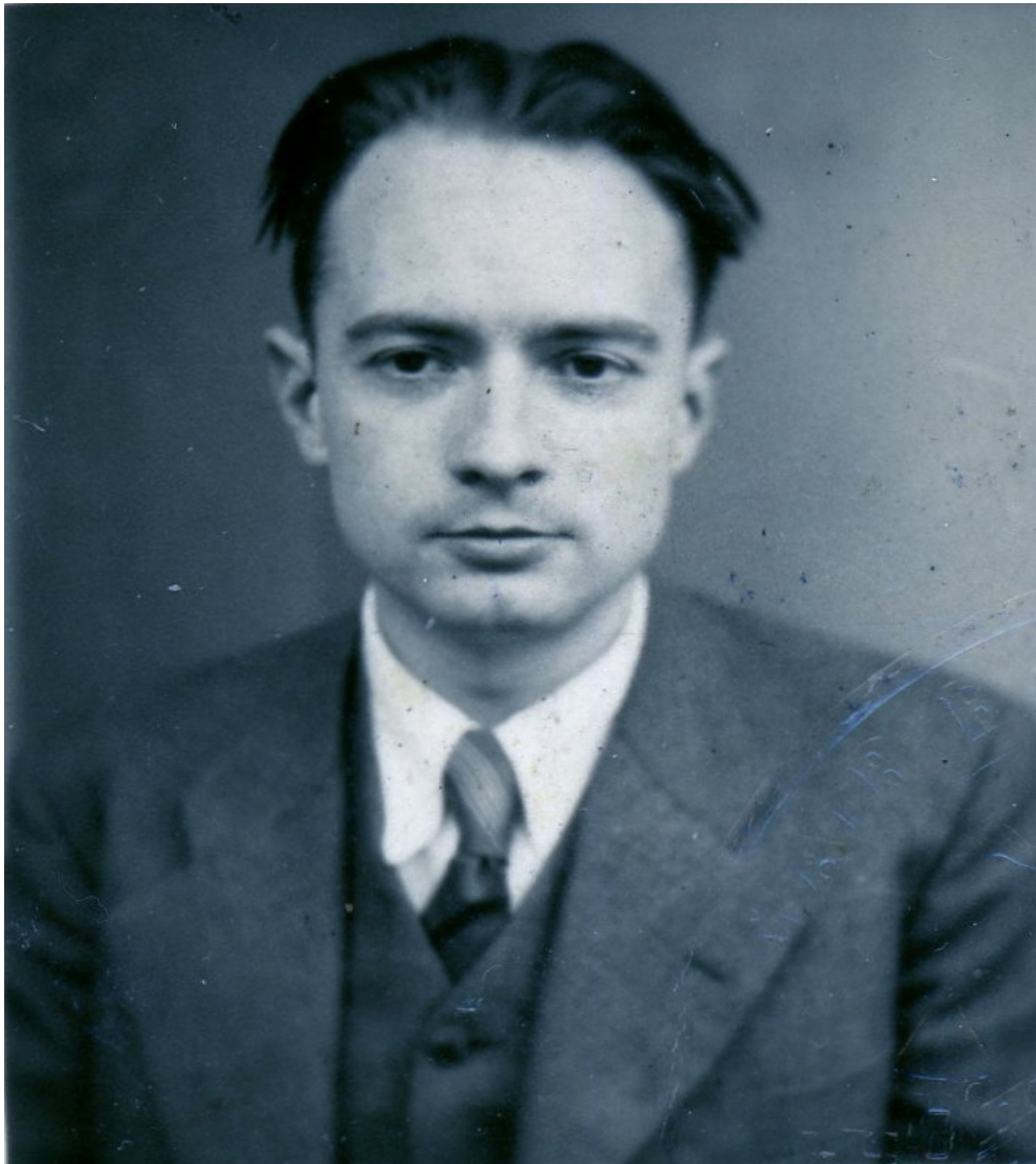
Jacques Ellul, November 29th, 1944. Official identity photo, Municipal Council of Bordeaux

The Ellul Forum is published by the International Jacques Ellul Society. Reasonable effort has been made to identify all copyright holders of materials published herein. The editor will be grateful to be notified of any corrections.